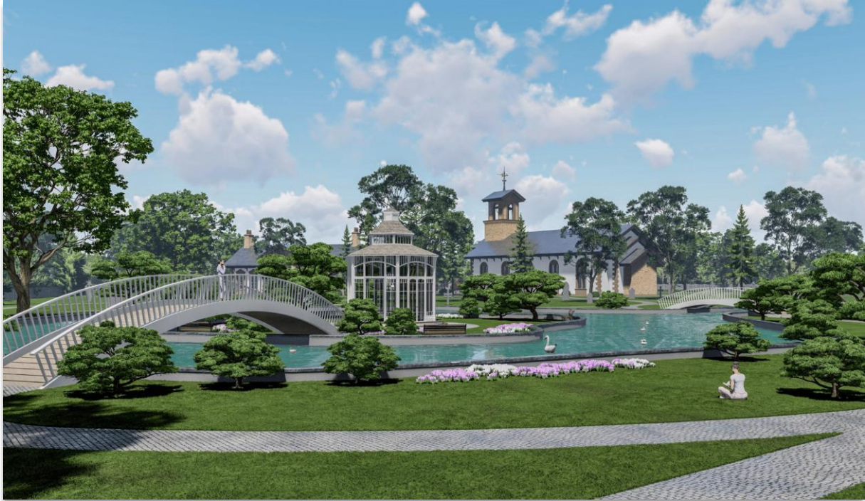
St. Raphael Square Prayer Garden