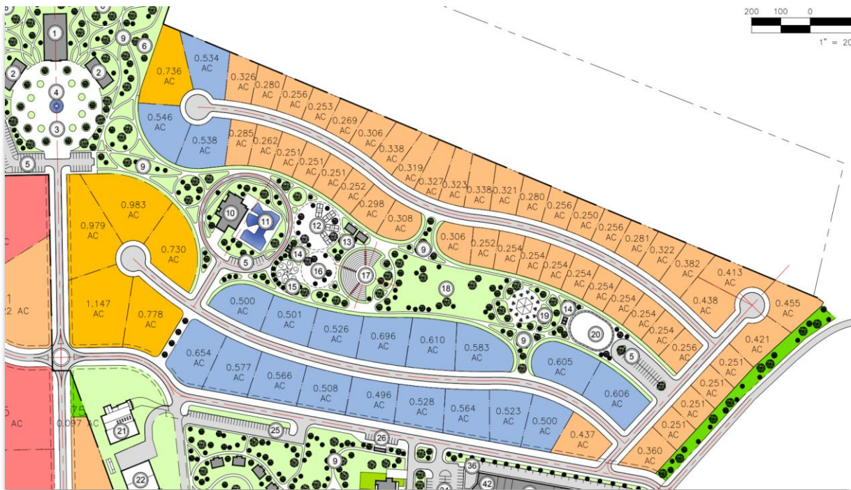
St. Joseph Quarter Site Plan

We'll talk about the financial feasibility of this construction in the business plan below, but for now, let's go north to the open-access development area, The St. Joseph Quarter.