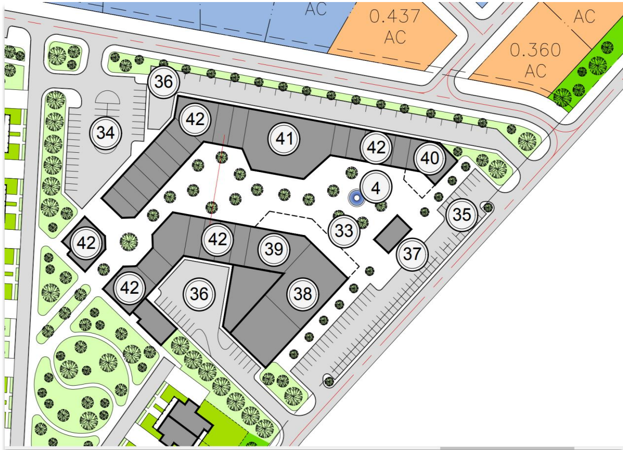
Veritatis Splendor Shopping Village Site Plan