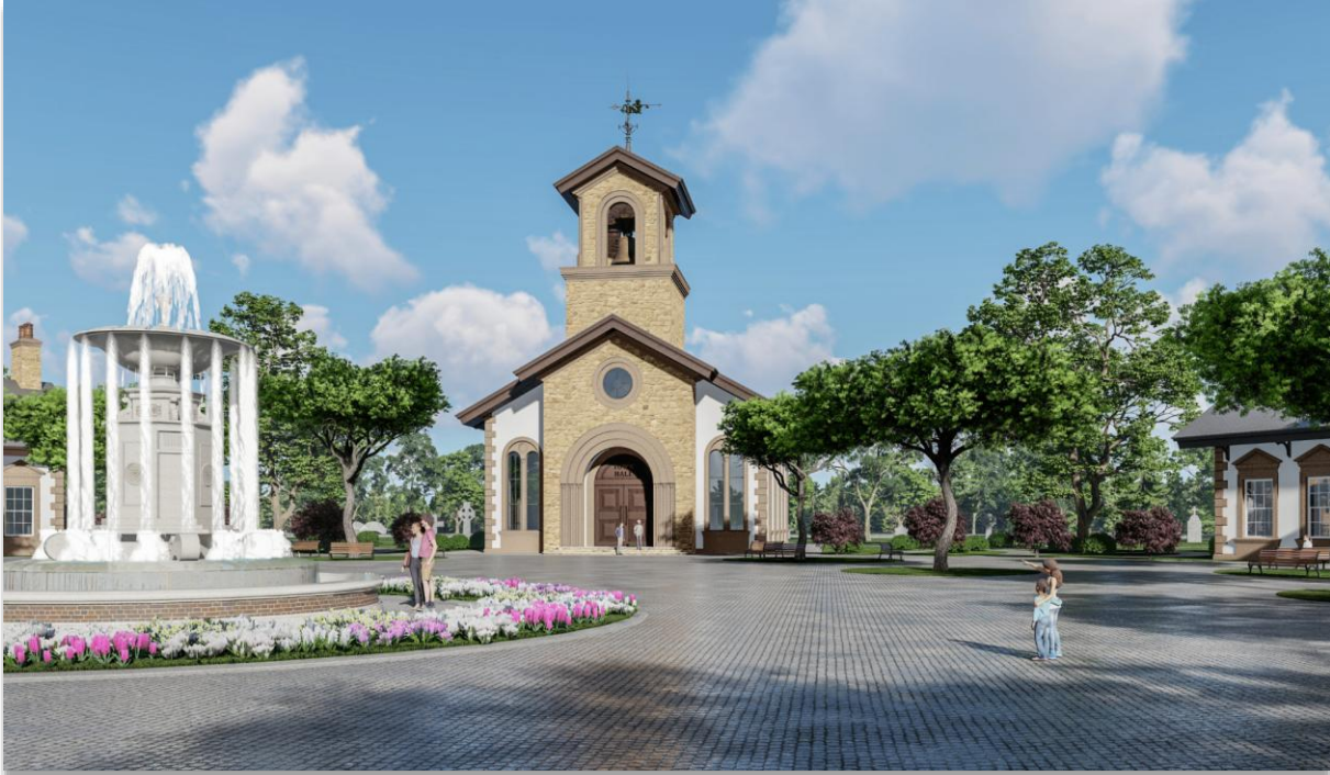
St. Raphael Square Chapel