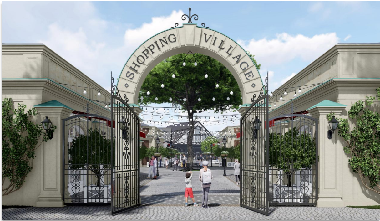
Veritatis Splendor Shopping Village Entrance

future development of Veritatis Splendor marches forward toward breaking ground, the details will be well-considered in advance.