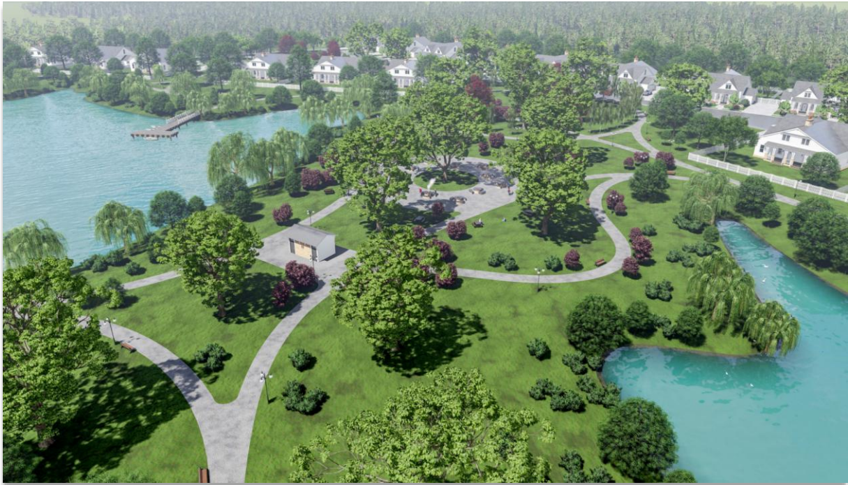
St. Catherine Labouré Quarter Walking Trails

The entire St. Catherine Labouré Quarter was organized around that mission: the walking path around the property's beautiful lakes, emphasizing gentle exercise and time in nature; the BBQ pavilion situated between the lakes encouraging community meals; the community building and library for planned social events and personal edification. All designed with a consistent emphasis on peace, quiet, and community.