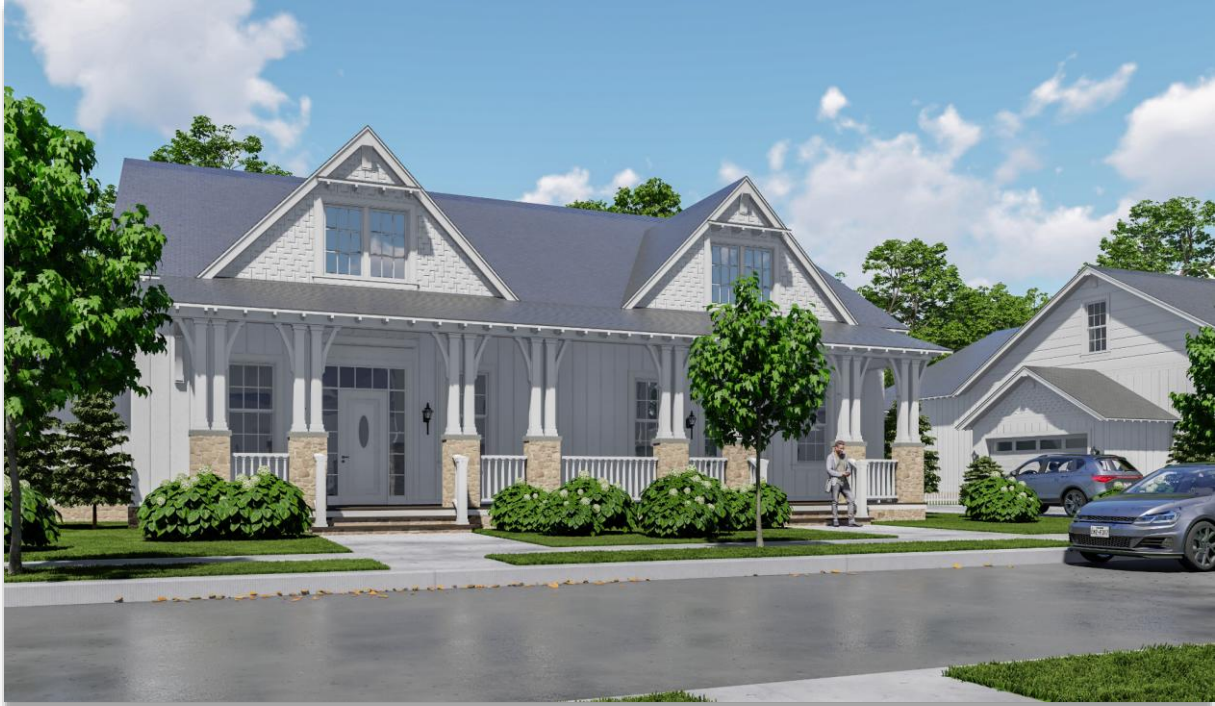
St. Catherine Labouré Quarter Homes