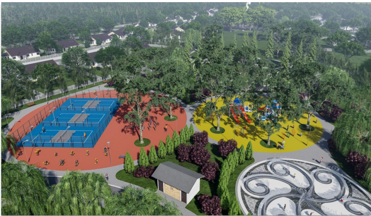
St. Joseph Quarter Central Park

Here, there's a central park, surrounded on all sides by backyards instead of roads. This park emphasizes family life, including a fitness club, pool, sporting facility, playground, play fountain, amphitheater, picnic area, open play area and a dog park.